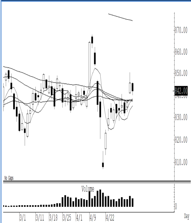
S50M24 (Close 842.70 Chg -3.70)

ย่อตัวลงมาเล็กน้อยในกรอบ ถือว่ายังไม่เปลี่ยนแนวโน้ม สั้น ๆ ไม่ต่ำกว่าแนวรับแถว ๆ 840 จุดได้แล้ว มีลุ้นไปต่อแถว ๆ 835 จุดต่อไป แนะนำให้ trading ในกรอบ 835-855 จุด ระวังกำไร